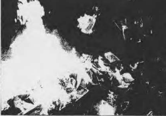
In protest: Jewish settlers opposed to the forced withdrawal start a fire Sunday near Neve Dekalim, Gaza.

9,000 settlers being forced out of Gaza, West Bank