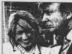
TV bosses: Martha Stewart and Donald Trump