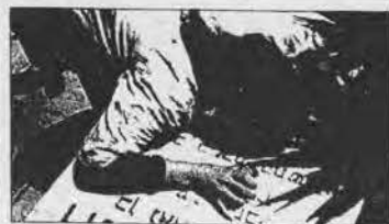
In Gush Katif, Gaza: A Jewish settler weeps over a grave at the cemetery Sunday. Authorities will relocate the graves to Israel.

A Jewish extremist group calling itself the National Home Movement claims there are "10,000