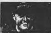
Mickelson: Will finish final round today