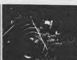
Crashed jet: Firefighters extinguish a blaze near the tail fin of Helios Airways Flight ZUS22 on Sunday.